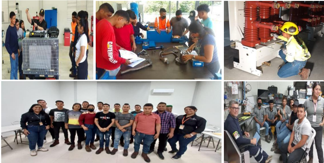
Figura 2. Aprendices en el área de trabajo y en el centro de entrenamiento